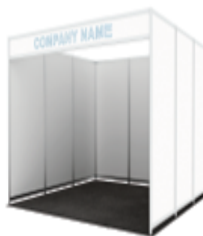
Option 2: Includes Logo/Name Header