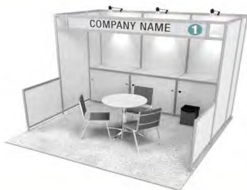
Option 1: Includes Logo/Name Header 3 built in counters, 1 round table, 3 chairs, 1 wastebasket & 3 arm lights